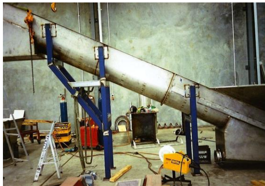
Classifier Fabrication at Malaga Workshop VOR Environmental

The company ensures all personnel are qualified, experienced and trained to produce the quality product for which Ironmonger Fabrications credits its successful growth.