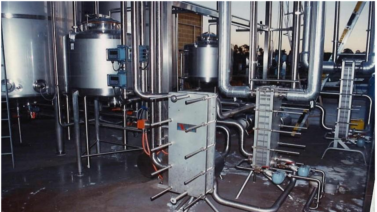
Heat exchanger and process piping fabrication and installation