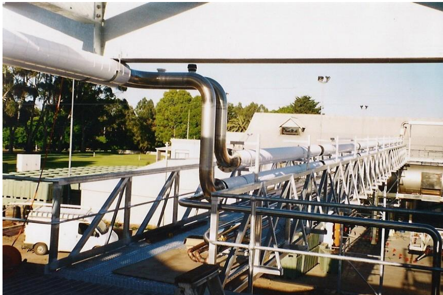
Process Piping fabrication and installation Gundry Winery

Protection of the environment is practiced in all company operations. Control and disposal of waste materials is carried out in accordance with legislative and council requirements. The company is able to demonstrate adherence to elements of ISO 14001 necessary to fulfill clients' project contractual obligations.